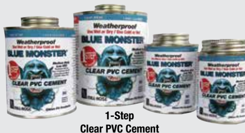
1-Step Clear PVC Cement