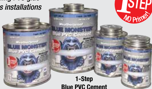
1-Step Blue PVC Cement

Self-priming PVC glue simplifies installations