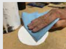
550% absorbent capacity.

Self-feeding container goes anywhere you need it.